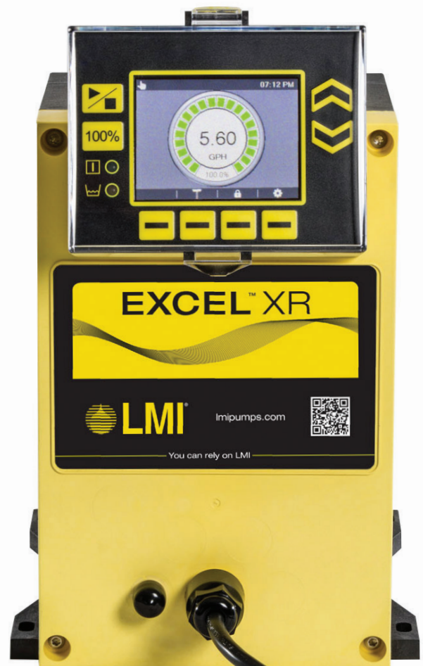
Pictured: Manual model

Selecting the right pump just got easier. No complicated configurations are necessary to find the right pump. With the Manual and Enhanced models offered, simply pick the features that fit your needs (see page 6 for a complete list). Both models offer a wide range of functionality including backlit display, multilanguage, and remote signals to name only a few.